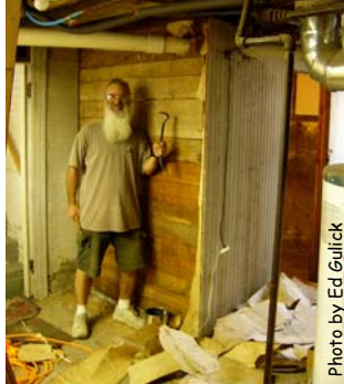
Right: Engaged in a deconstruction, insulation, excavation and reconstruction project!